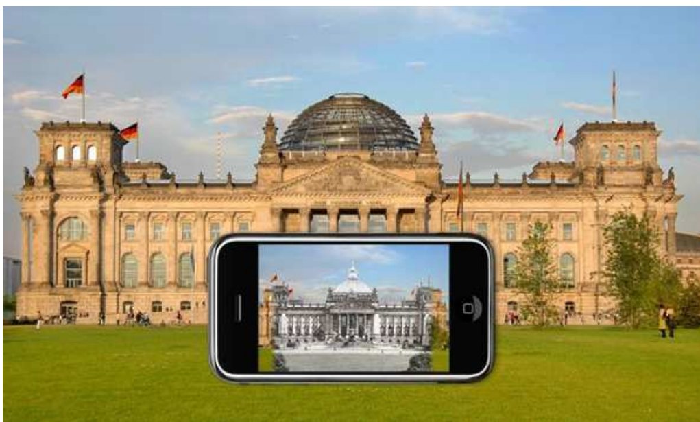
Figure 6: Reichstag past and present (Fraunhofer Institute for Computer Graphics, 2009)

Although this technology is currently limited to these two buildings its development holds great potential to the architectural historian. Since the inception of photograph 150 years ago many significant building throughout the world have suffered through natural disasters, war damage or 'modernization'; this holistic and corresponding mapping of a building gives a new and very accurate documentation of the building. However, such a visual mapping not only assists in a historic understanding of the building in its changing context and documentation of the building but it also has the potential to be an important tool in assisting future restoration plans. A perfect example for the use of this technology is the Cathedral of Christchurch, New Zealand. After the earthquake of 22/02/11 this historic Cathedral in the heart of Christchurch is to be demolished. By using this technology it will be possible to document of the old Cathedral in conjunction with the new reconstructed Cathedral; therefore preserving the historic architectural record, within one holistic presentation, for future research.