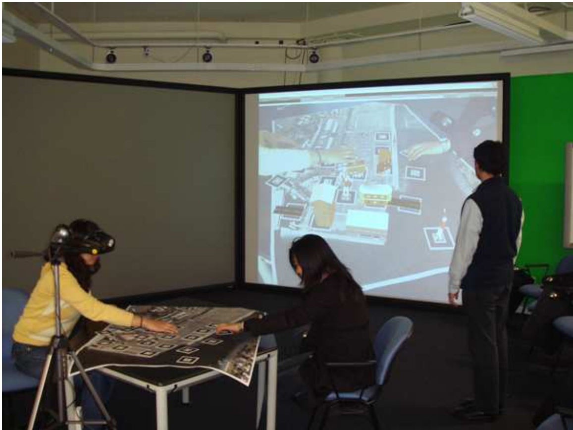
Figure 7: Collaborative research using ARUDesigner for urban planning proposal review simultaneously in both the virtual world and the real world (Wang et al. 2008)

Currently the ARUDesigner consists of a PC, a HMD, a video camera as sensing device, and tracking markers. The virtual objects are pre-modeled in ArchiCAD. Using this system, designers are able to modify the layout of the virtual urban models by directly controlling the corresponding physical blocks that are placed in the real design environment. Extending from this concept, architectural historians can apply AR to interpret and explore architectural designs.