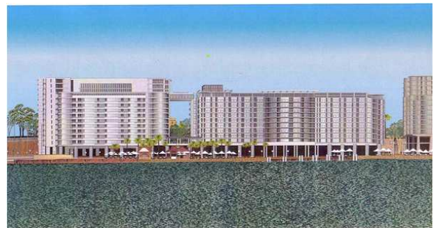
Figure 1: East Circular Quay, Sydney Cove, 2011

Sydney, Australia is a perfect example of a changing cityscape which has only existed for just over 220 years and has rapidly grown from a tent city of 546 people in 1788 to the modern city it is today of 4.2 million people. In a current project Sydney Cove's architecture is being examined through time. Sydney Cove is the heart of Sydney, the project has divided the Cove into four sites, which neighboured each other, each site is being illustrated using Coral Draw from a fixed point through time, from 1788 to the current time. Surprisingly Sydney's streets are not well documented and the position of some buildings that are long ago demolished can be difficult to ascertain, and are often only known through a record of their destruction to make way for another building.