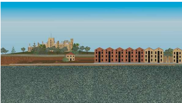
Figure 4: East Circular Quay, Sydney Cove 1875