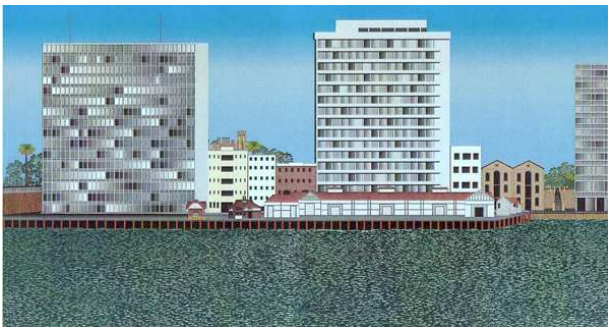
Figure 2: East Circular Quay, Sydney Cove, 1962

slowly it becomes possible to reconstruct lost architecture and/or city plans. By examining the space created within this 2D world it is possible to add or subtract buildings to build up a profile of the changing landscape of a site over time. This is a simple but very effective tool in creating the sections of each site from a fixed point, which highlight the changes in a consistent format. However it has its downfalls since only the individual sections are being considered.